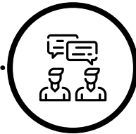
Adjusted care discussed with you

If you develop COVID-19 after your operation, the hospital team will consider your increased risks due to the recent surgery and provide supportive care to promote recovery from both the operation and any infection.