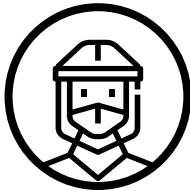
Fully equipped with PPE